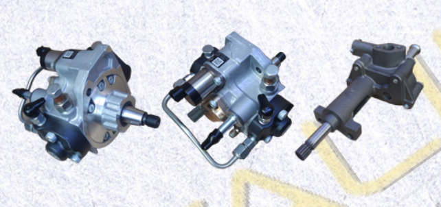
Fuel and Oil Pumps