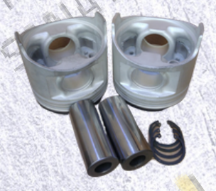
Piston Ring Pim Set