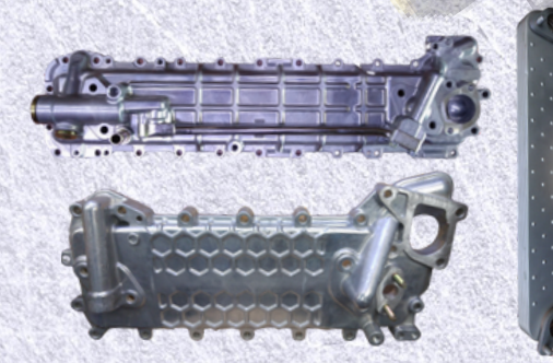
Oil Coolers and Covers