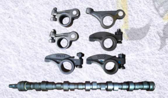
Rocker Arms and Camshafts