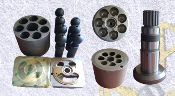
Hydrolic Pump Spare Parts