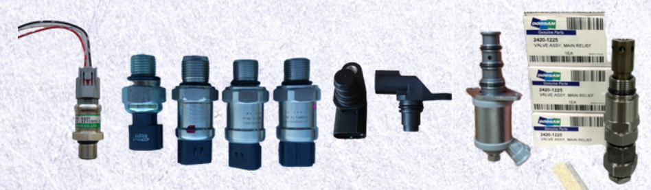
Sensors and Selenoids