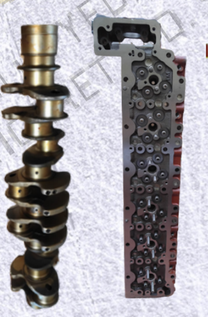
Cylinder Heads and Blocks