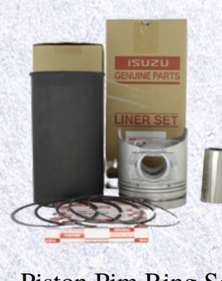
Piston Pim Ring Set