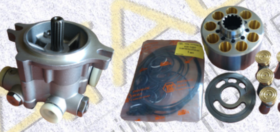
Hydrolic Pumps and Repair Kits