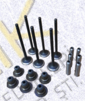
IN - EX Valves