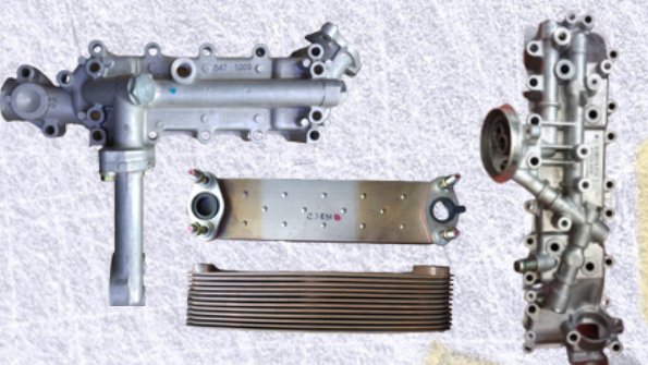
Coolers and Covers